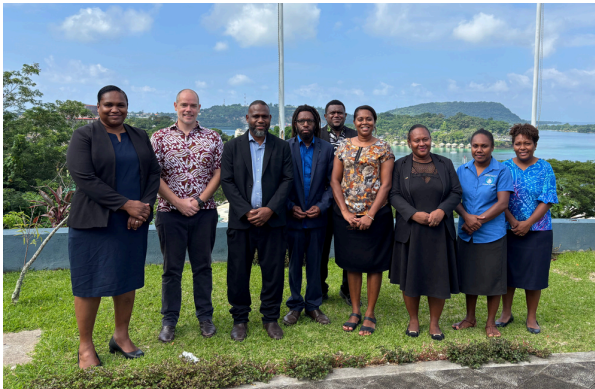
PC: Training participants from OPSC and NSC