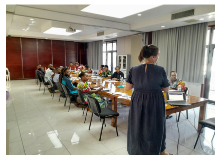
Compliance Officers and HR officers fully engaged during the workshop.