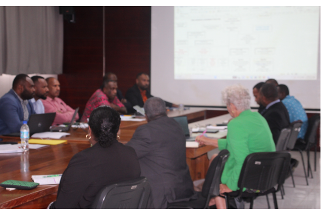
Participants at the Multi Agency meeting