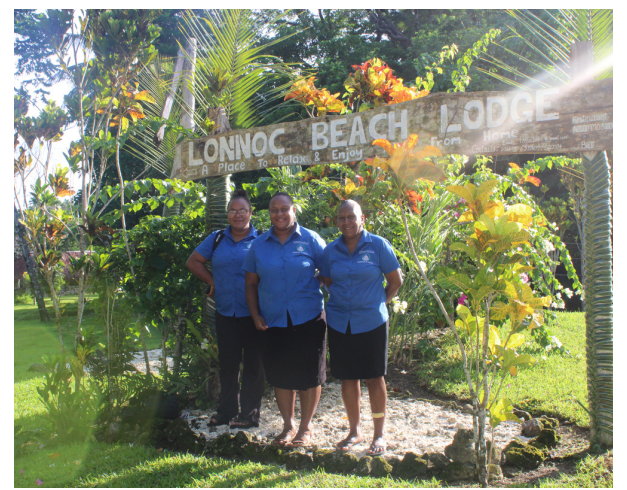
OPSC Staff at Lonnoc, Santo